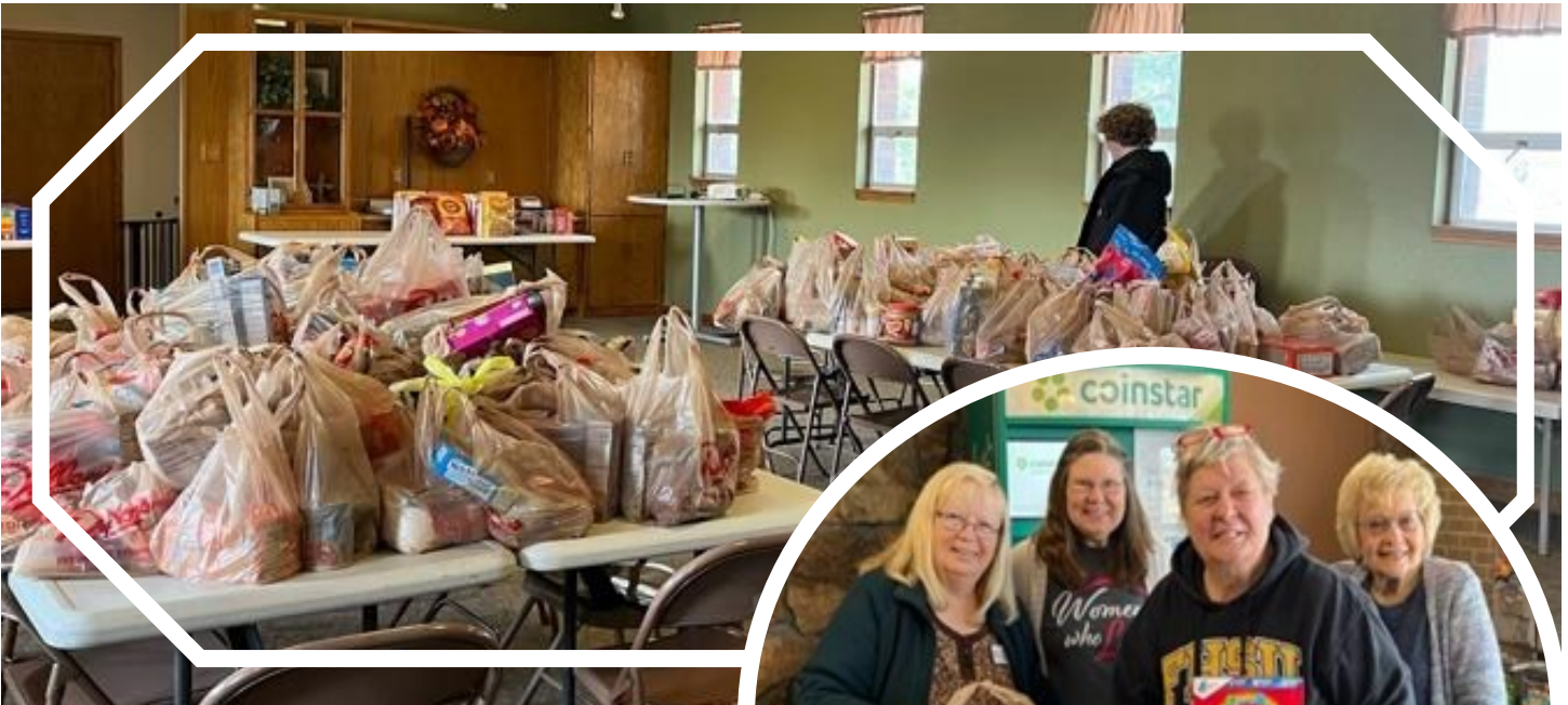
On November 23, volunteers stood outside Walmart and both Dillons for the Annual Thanksgiving Food Drive. Thanks to the stores, volunteers, and the people who purchased items to make this food drive successful! These groceries will be given out at the ECMA's Thanksgiving Day Feast to those who want some.