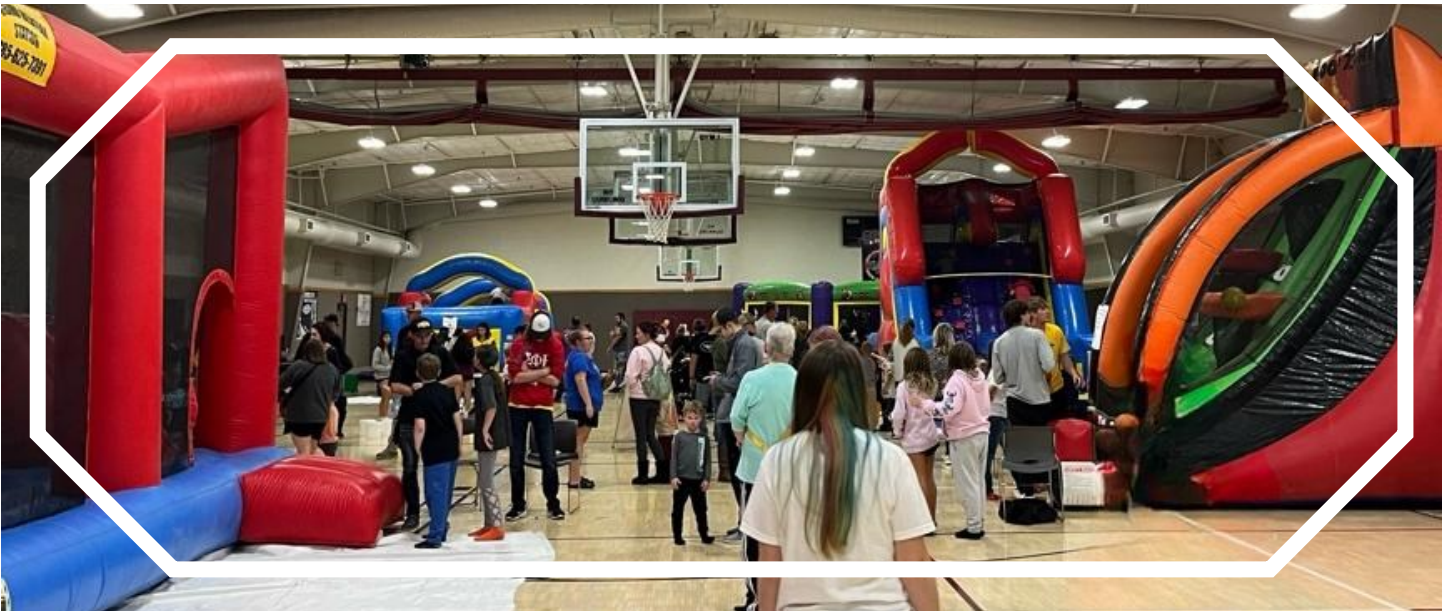
First Call for Help had a successful Carnival Night: Homes 4 the Holidays fundraiser. It was held on November 12th at the Hays Recreation Commission. Over 170 kids came to enjoy the inflatable fun. Thanks to all the volunteers and sponsors that made this event possible.